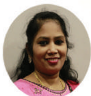
ZONE 3 SIS MANO 9010 2457 ANG MO KIO HOUGANG BISHAN