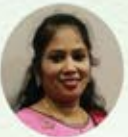
ZONE 3 SIS MANO 9010 2457 ANG MO KIO HOUGANG BISHAN